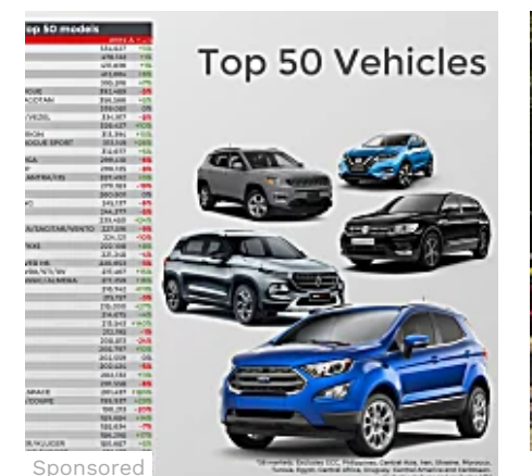
What's my car worth? Online

Calculator for Car Resale TrendingResults