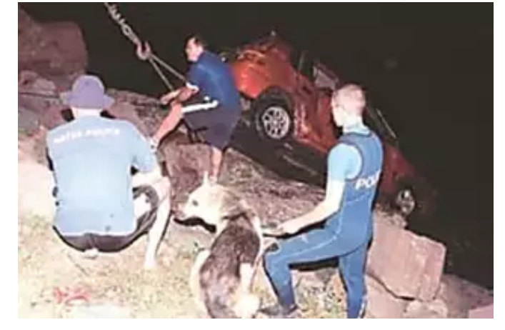
Suspected drag racers nosedive into lagoon http://www.iol.co.za/

This website uses cookies to ensure you get the best experience on our website. Learn more