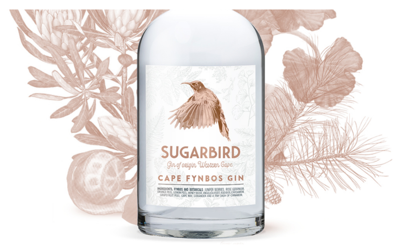
By Lonwabo Marele | Published Nov 16, 2017