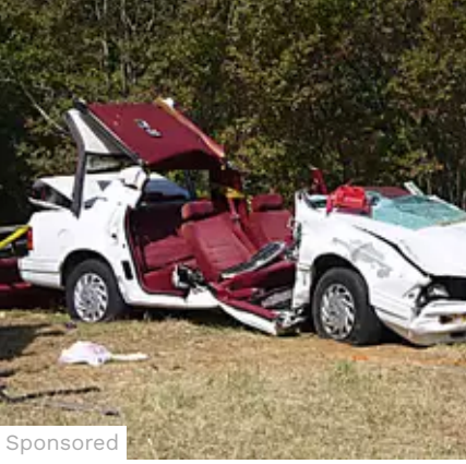
Stop Wasting Money On Car Insurance! Switch To This Company +[Free Quote] Auto Trends

Calculator for Car Resale TrendingResults