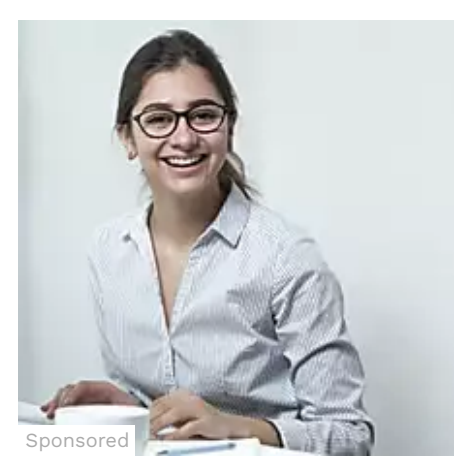
Do you speak English? Work for a USA company, Live in Port Elizabeth Work From Home Jobs | Sponsored