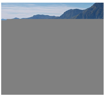
The Top 20 Destinations For 2020 top-20-destinations-for-2020)