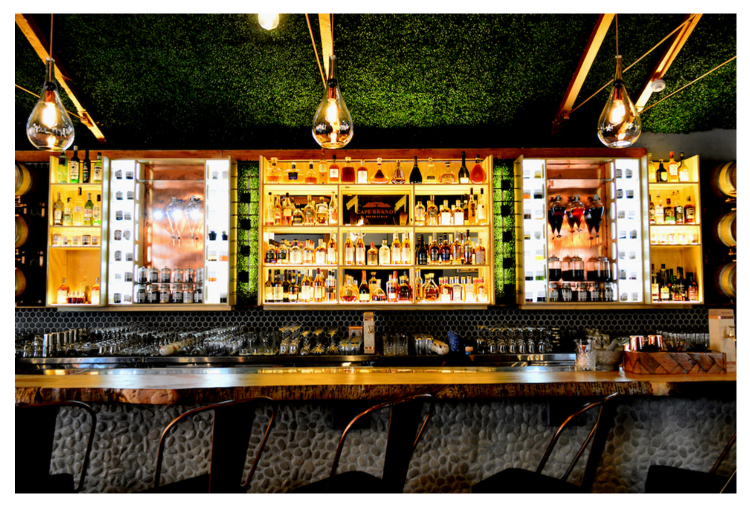
Cause Effect Cocktail Kitchen.

The vista from the Silo Rooftop is even more impressive, particularly as the sun dips behind Table Mountain.