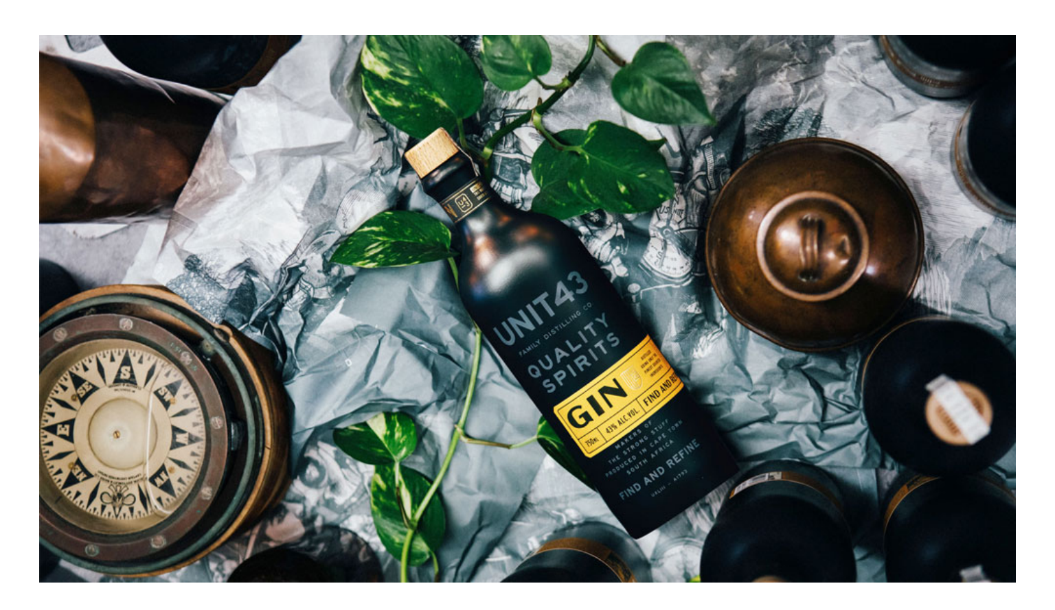
Voted Best in Africa 2020 - The Gin Guide UK

'Find and Refine' is the motto of the distillers at Unit43 Distilling Company. They find the best ingredients and refine them into the quality, award-winning, batch distilled spirits in every bottle of Unit 43 Gin.