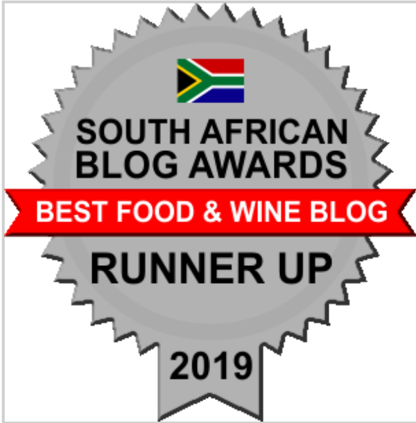
( https://morethanfoodmag.com/best-food-and-wine-blog-runner-up/ ).