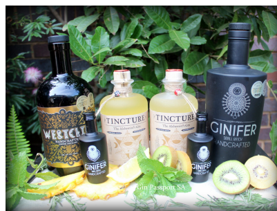
( http://www.ahbev.com/about%20us.aspx )

The Old Packhouse Distillery is situated on a farm near Tzaneen in South Africa and produces artisanal Gin. Only the finest ingredients are used in our handcrafted small batch gin. Our gin exemplifies country living