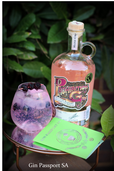
Gin Passport SA