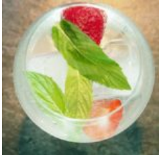
( http://ginpassport.co.za/ginspiration/mintandstrawberry/ )

We at Gin Passport love the Gin Revolution and we have made it our mission to explore as many gins as we can!