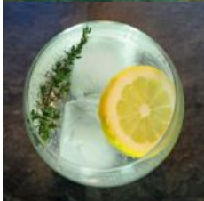
( http://ginpassport.co.za/ginspiration/lemonandthyme/ )