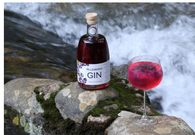
( https://theoldpackhouse.co.za/ )

Duke is an exotically fragrant gin - traditional and tropical botanicals are gradually infused during distillation to produce a balance between sweet, fresh hints of rose, ginger and honey, and grounded, earthy tones of juniper berries and macadamia. Our forever-faithful companion, Duke the Vizsla, reminds us that persistence and consistency are key to producing the perfect gin, every time. Best served with tonic, ice, vanilla and sage.