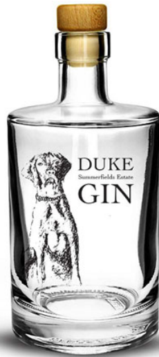
( https://summerfields.co.za/the-birth-of-duke-gin )