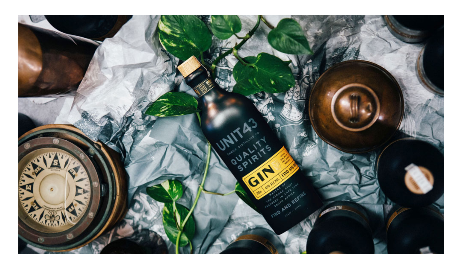
Voted Best in Africa 2020 - The Gin Guide UK

'Find and Refine' is the motto of the distillers at Unit43 Distilling Company. They find the best ingredients and refine them into the quality, award-winning, batch distilled spirits in every bottle of Unit 43 Gin.