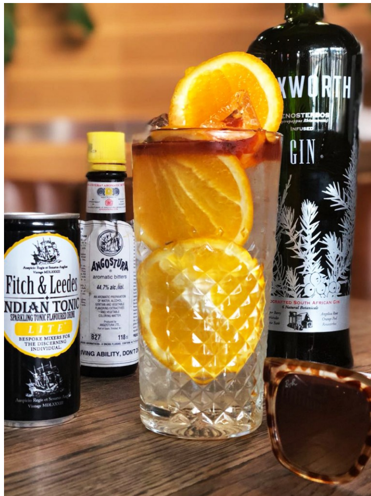
Wixworth Gin with Lite Indian Tonic, garnished with fresh Orange slices and Angostura Bitters.

Why not try out one of each on your next visit and identify your favourite! Remember on Thursdays, they also offer Slider Thursday where every slider is R20 per slider (minimum 3 per person) – what a winning combination! You can read more about that and see the full menu on my blog [here] .