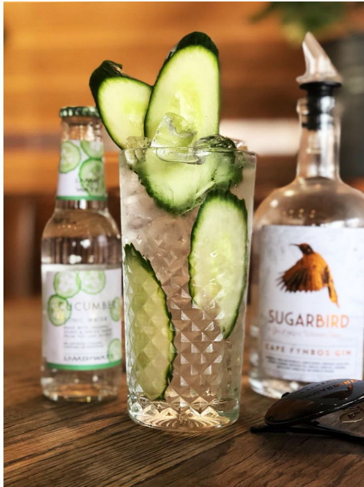
SugarBird Gin with Cucumber Tonic, garnished with sliced Cucumber.