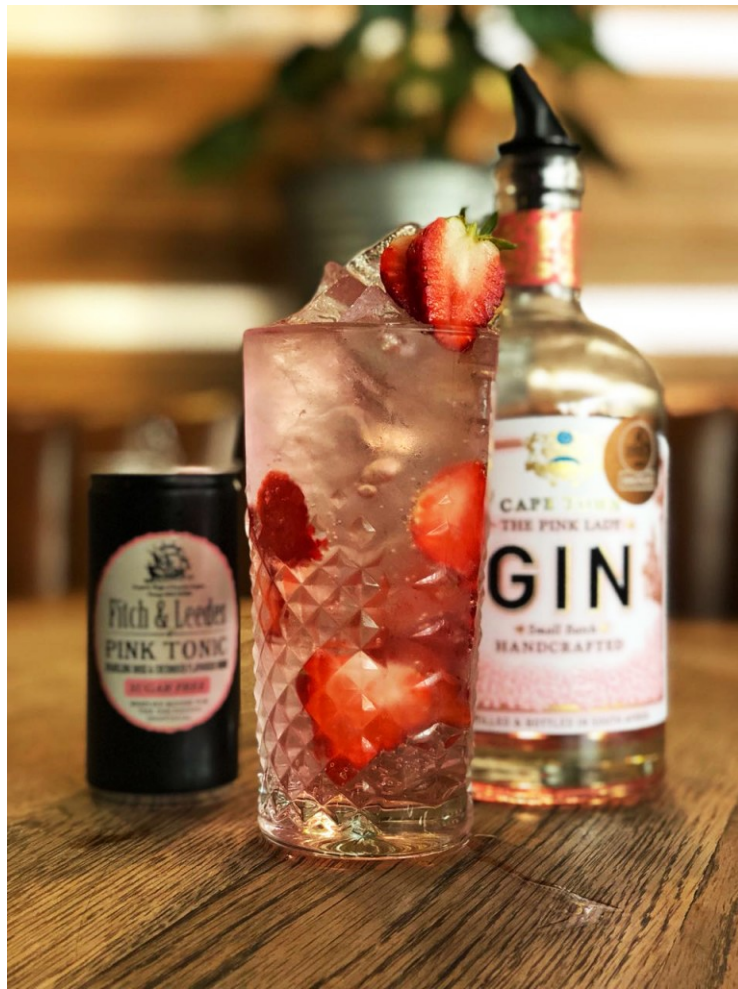
Cape Town Pink Lady Gin with Sugar Free Pink Tonic, garnished with fresh Strawberries.

Hudsons – The Burger Joint is famous for its happy hour that runs from 4:30pm – 6:30pm Monday to Friday, but did you know that it now also includes their build-your-own gin unique to their menu – at half the price during this period. That's R34,50 per single G&T! Here's a little insider tip, they also offer buy-one-get-one-free on all burgers if you have the Entertainer App 2018.