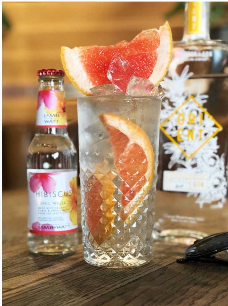
Orient Gin with Hibiscus Tonic Water, garnished with fresh Grapefruit.

Tags: Angostura , Bitters , Blogger , capetown , cocktails , Cucumber , gin , Grapefruit , HappyHour , hudsons , lemon , Mixology , orange , Slider , Strawberry , Tonic Col'Cacchio Celebrity Chef Showdown 2018 Red Bull Coconut & Berry Summer Edition