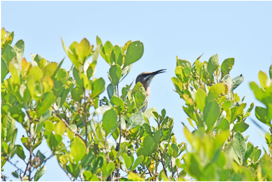
Far away on the top of the hill you can see cattle grazing under the trees