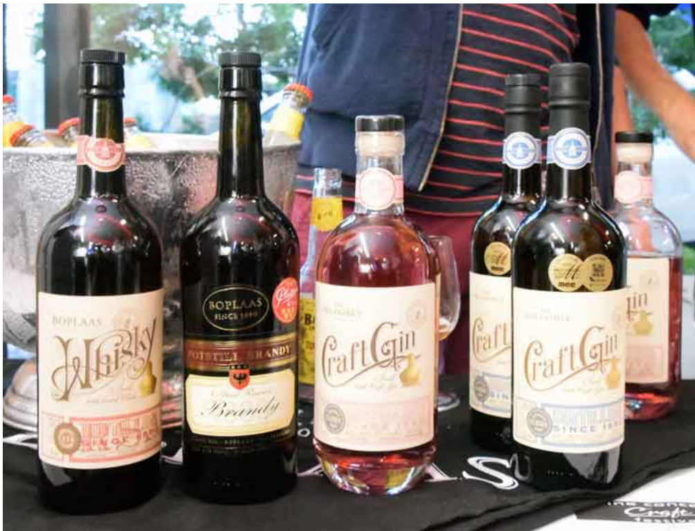
From Cederberg Winery, Boggom Beers: a light and well flavoured Lager, a biscuity and citrus zing Blonde Ale which Lynne really enjoyed, and an IPA with granadilla notes, nicely fruity and not too bitter. We know it's good with food, we have ordered it in restaurants