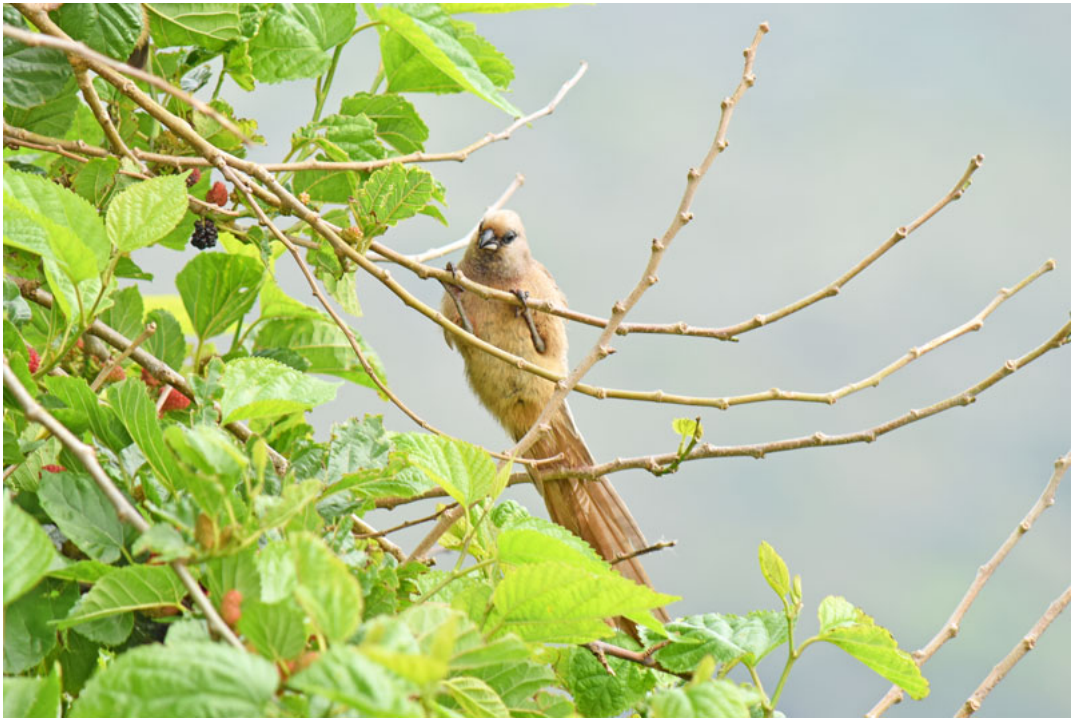
Chris arrived at about 11 and took us on a small veld walk to see the local plants and birds