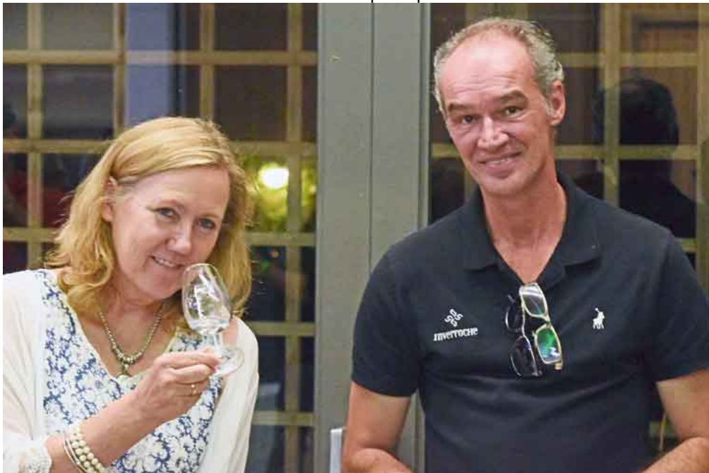
Another of our favourites: Devils Peak Brewery - their King's Blockhouse IPA is one of Lynne's best beers