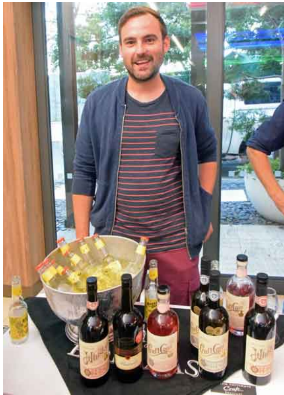
A close up of the bottles