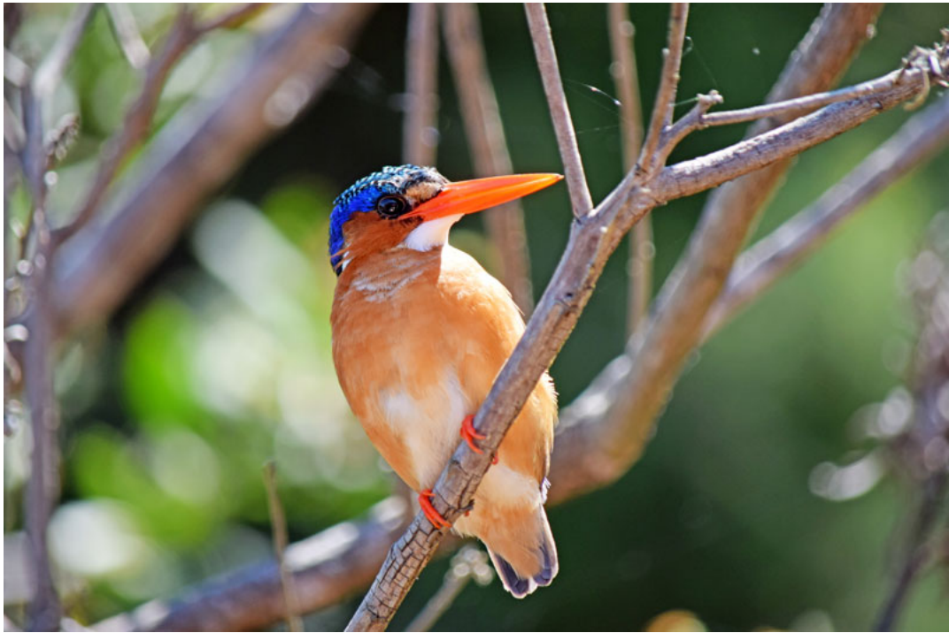
It rained heavily that night and this is the misty sunset, warning of the wet day to come