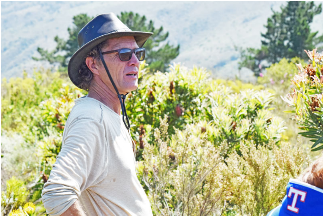
The wild flowers are in bloom in October