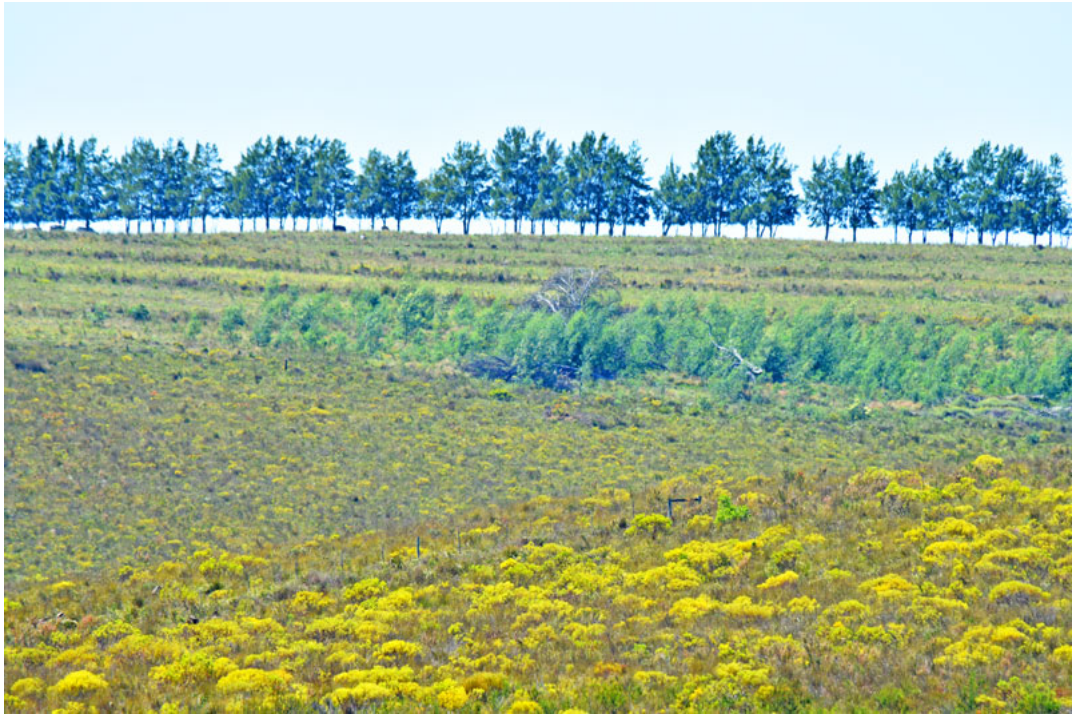
It is the end of the season for these Waboom trees, which the birds love