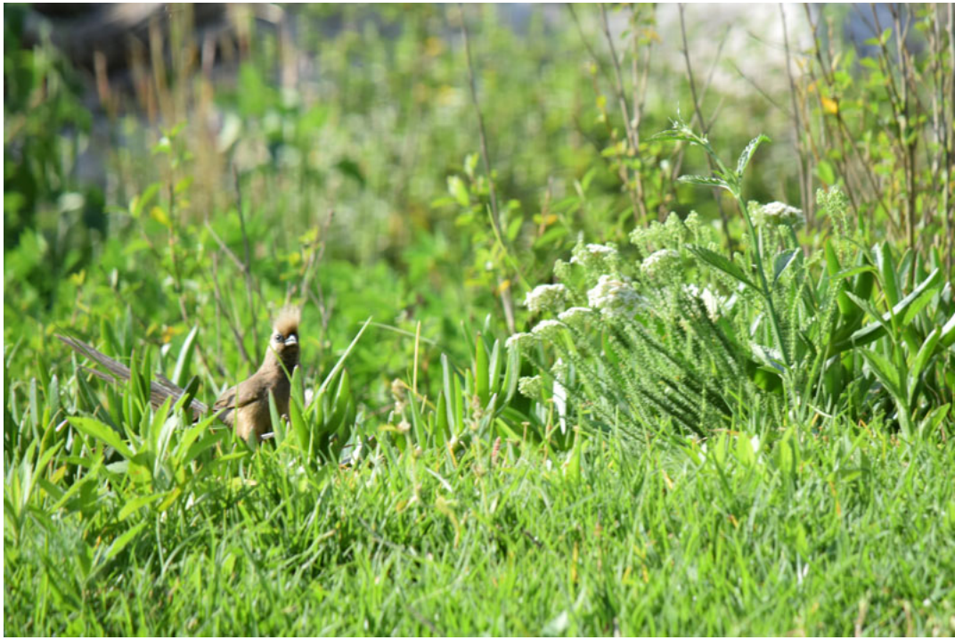
The early morning mist