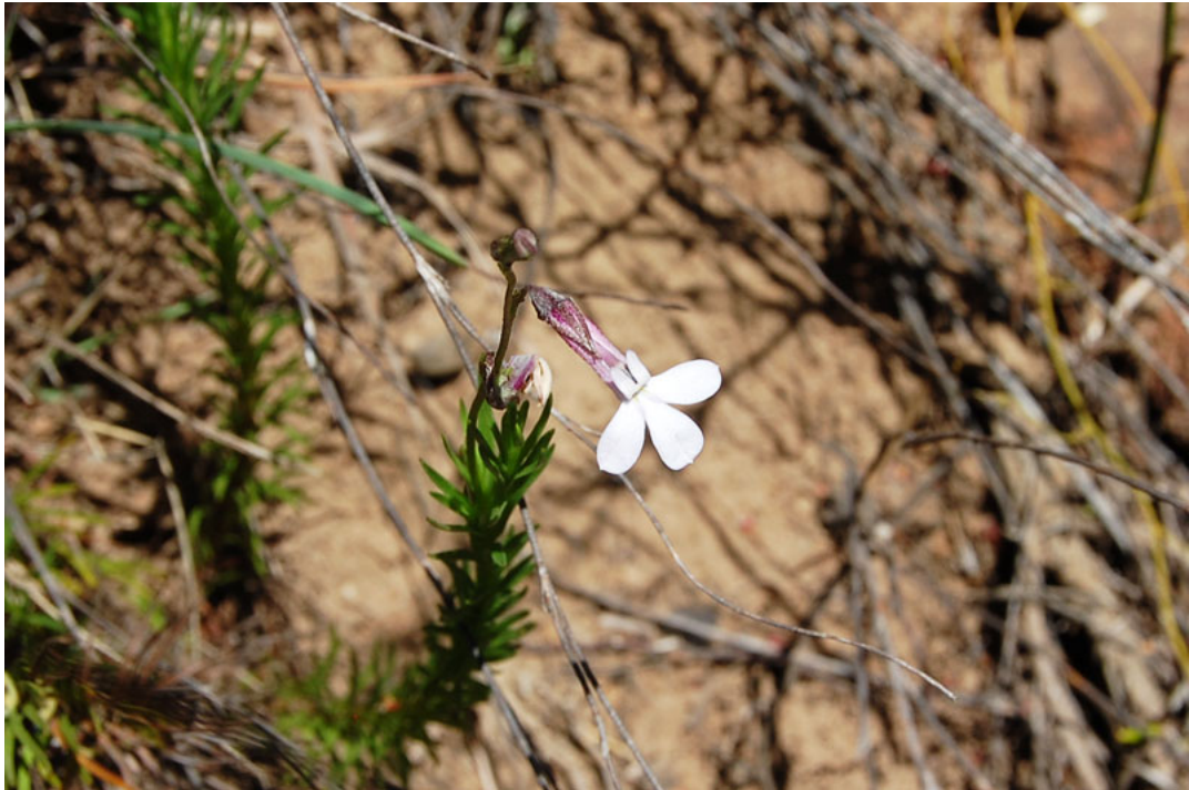
A Pagoda Mimetes attracts lots of birds