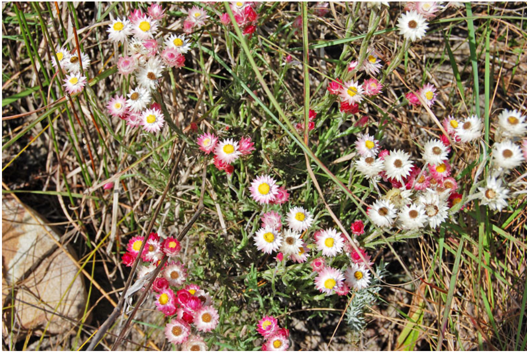
You can sit amongst the proteas