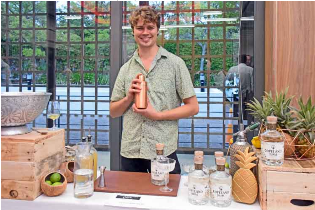
He made us a great sour cocktail with rum, sugar syrup, fresh lime juice - what a difference that makes - coconut water and no much ice. Absolutely superb