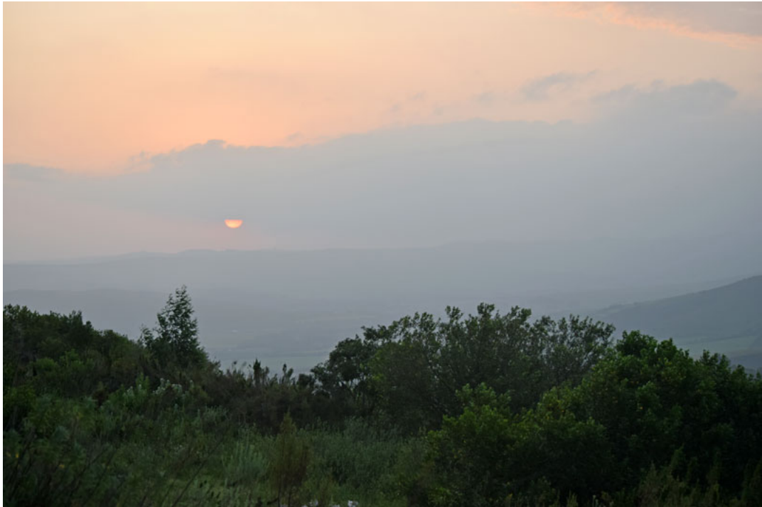
It is a beautiful sunset